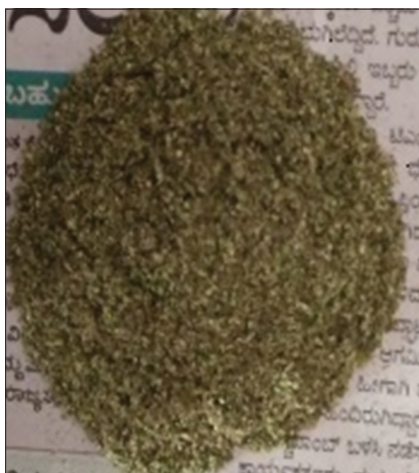
Figure 1: Dudhi seed powder

In our study, we used four microbial cultures procured from National Centre for Cell Science Pune, India. Gram-positive