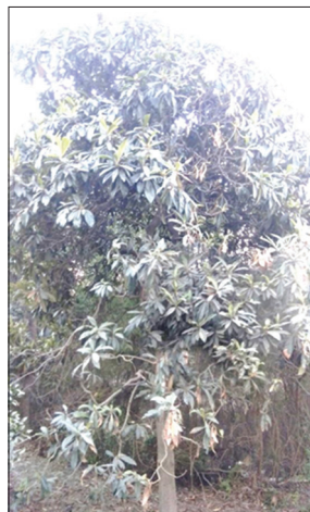
Figure 1: Habitat of Eriobotrya japonica is an evergreen plant

The monograph of E. japonica is mentioned in the Japanese Pharmacopoeia. However, standards for E. japonica is not published in any on the Indian monographs as the quality