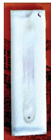
Figure 3: Image of thin layer chromatography analysis of Eriobotrya japonica leaves methanolic extract in water:acetonitrile (3:2)