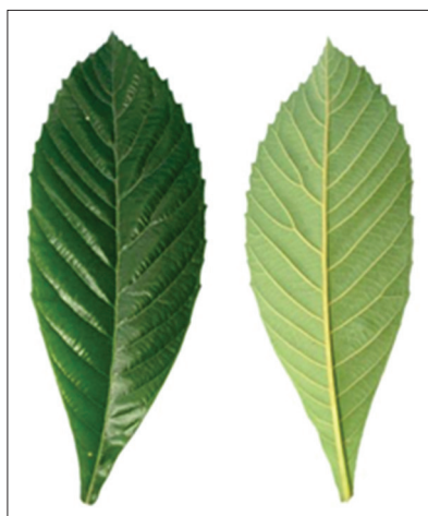
Figure 2: Leaves of Eriobotrya japonica

of plant-based products may be affected by factors such as location, climate, cultivation, and collection. Hence, there is a need to develop the standards for E. japonica as per the climatic conditions on India. Hence, the present study was designed to develop the physicochemical, qualitative, and chromatographic standards for E. japonica . Further, the extract was also evaluated for the in vitro antioxidant and antidiabetic activity.