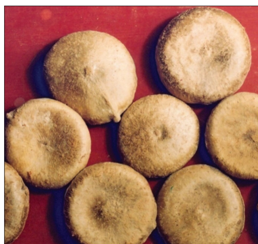
Figure 3: Seeds of Strychnos nux-vomica

In general, seeds of S. nux-vomica are used as a medicine. 2.6-3% total alkaloids are present in seeds. The major alkaloids are strychnine (1.25-1.5%) and brucine (1.7%) whereas minor alkaloids are vomicine and igasurine [16] including loganin, \alpha -colubrine, \beta -colubrine, n-oxystrychnine, 3-methoxycajine, isostrychnine, protostrychnine, pseudostrychnine, novacine, and chlorogenic acid. [17] Strychnine and brucine are the main bioactive molecules which are responsible for the cytotoxic activity of S. nux-vomica [Figure 4].