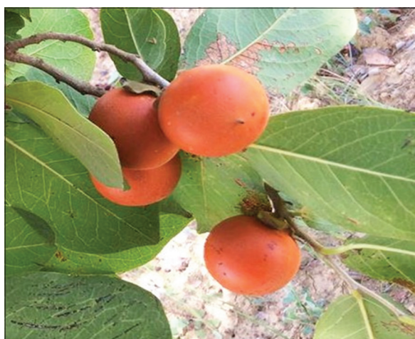
Figure 2: Fruit of Strychnos nux-vomica

side; flowers greenish white, small in size, funnel-shaped, terminal cymes, having unpleasant odor, and blooming in winter. The size of fruit is like a big apple with a smooth and hard shell. Shell having bright orange color when ripe and filled with white pulp containing five seeds [Figure 2]. The seeds are removed from the ripe fruit. They are generally exported from ports of South India; Cochin and Madras. The seeds have the shape like a flat disk, covered with dense silky hairs, radiating from the center, and giving a characteristic shine to the seed; they are very hard with a dark gray horny endosperm embedded with a small embryo; odorless and bitter in taste [Figure 3]. [15]