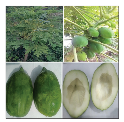
Figure 1: Aerial vegetative parts and fruits of Carica papaya plant

Both ripe and unripe papaya fruits possess huge quantities of herbal antioxidants. Its leaves, fruits, and seeds contain caffeic acid, myricetin, rutin, quercetin, \alpha -tocopherol, papain, benzyl isothiocyanate (BiTC), and kaempferol. These correctly lessen reactive oxygen species (ROS) production.<sup>[9]</sup> C. papaya seeds brought about antifertility, anti-implantation, and reduced progesterone stage and estrus cycle.<sup>[10]</sup> Plant indicates a couple of organic sports, i.e., antiviral, anti-diabetic, anticancer, anti-angiogenic, antiparasitic, antibacterial, antiviral, and anti-malarial sports. Plants show multiple biological activities, i.e., antiviral, anti-diabetic, anticancer, anti-angiogenic, antiparasitic, antibacterial, antiviral, and anti-malarial activities. This plant also possesses nephroprotective, antifertility, antiimplantation thrombopoietic effects. Papaya pulp is used to manage burn injury, anemia, and stress release. In the present review article, nutritional benefits of papaya have been described with its phytoconstituents, biological activities, and therapeutic properties.