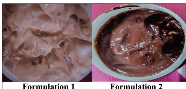
Figure 1: Embelin emulgel

The formulated embelin emulgel was evaluated visually for its color, appearance, and consistency. Along with that organoleptic test, homogeneity, and pH also tested.