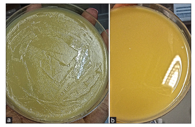
Figure 1: The efficiency of irradiation by the example of Xe lamp treatment: (a) Control sample; (b) treatment with the impulse xenone lamp with the dosage UV-S 30 \text{ mJ/cm}^2 . Initial contamination on the test object - 3.2 \times 10^6 \text{ CFU}

Thus, the relatively recently discovered and extremely harmful phytopathogen D. solani is characterized by a high sensitivity to the action of UV radiation as a biocidal agent.